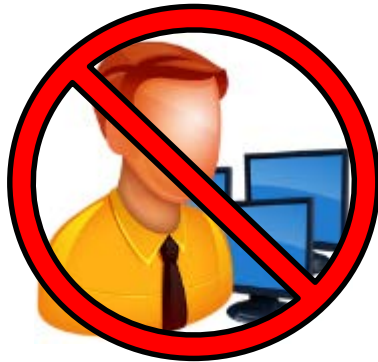
No IT Help